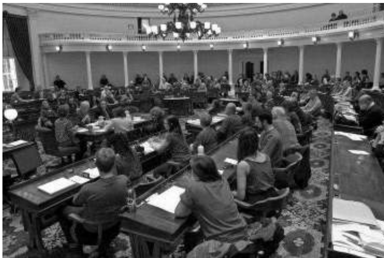
People's Team at the Statehouse

Kick off the legislative session by saying - Put People First!